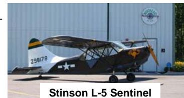
Stinson L-5 Sentinel